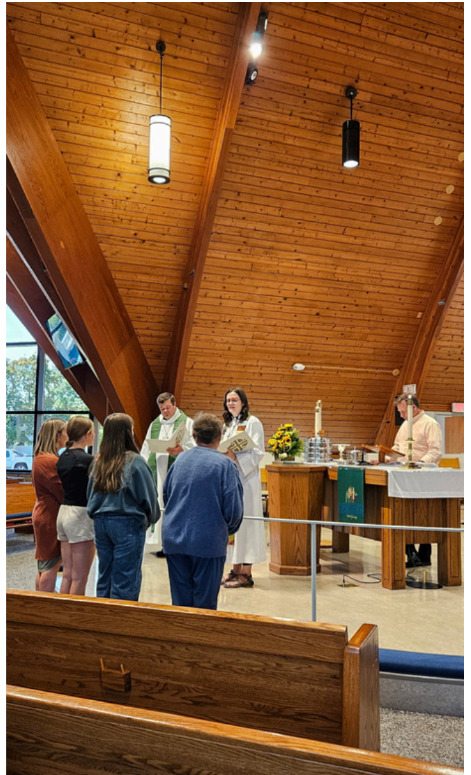
Teacher Installation, July 2025