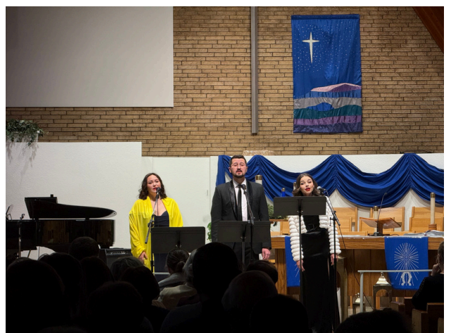
Ukrainian Benefit Concert, November 2025