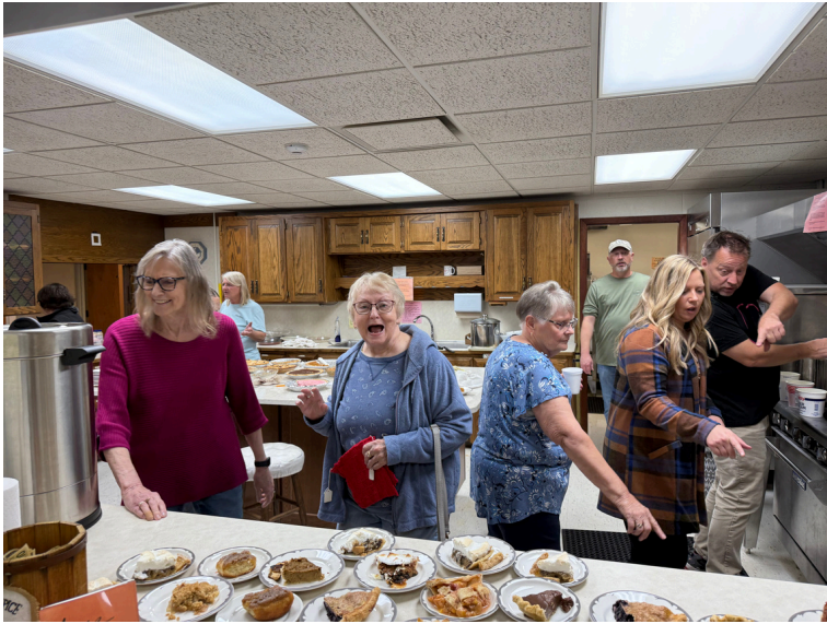
Pie and Coffee Day, October 2025