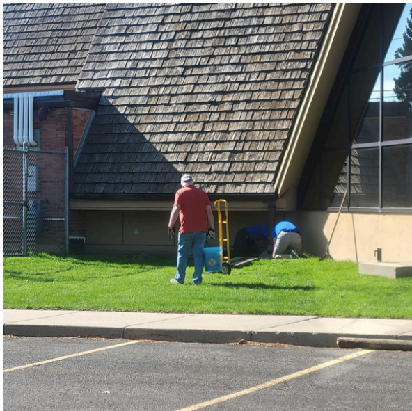
Men of Faith Working On Landscaping and Brick Work