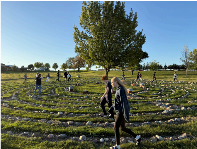
Confirmation Class at U Mary Labyrinth