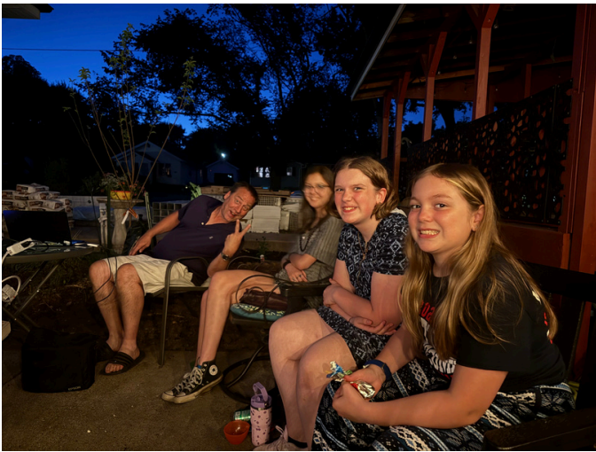
Youth Outdoor Movie Night