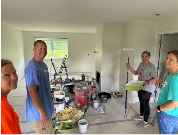
NC Mission Trip, July 2025