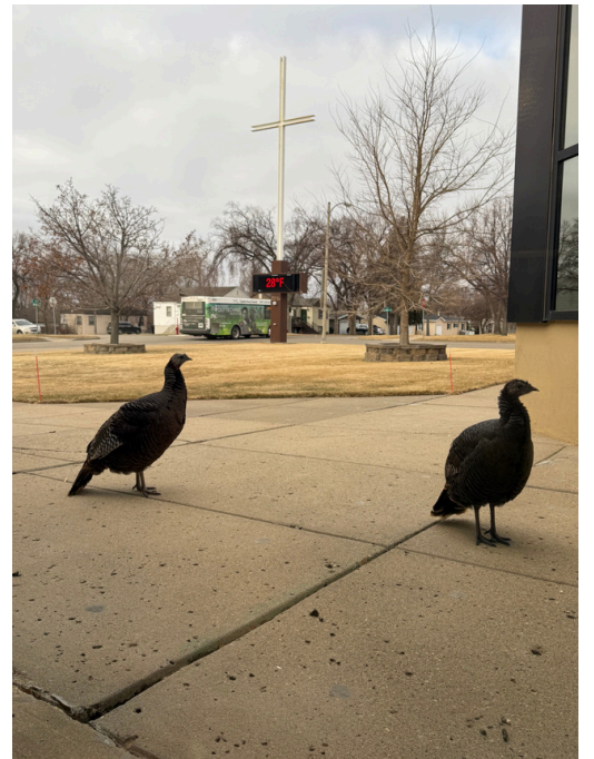
Wild Turkeys Outside of Sanctuary, March 2025