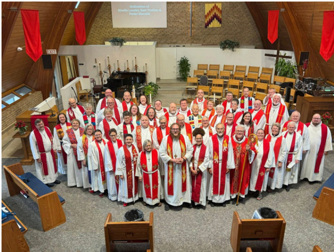
Summer Ordination, August 2025