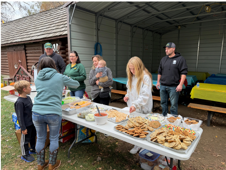
Family Fun Day at Papa's Pumpkin Patch, October 2025