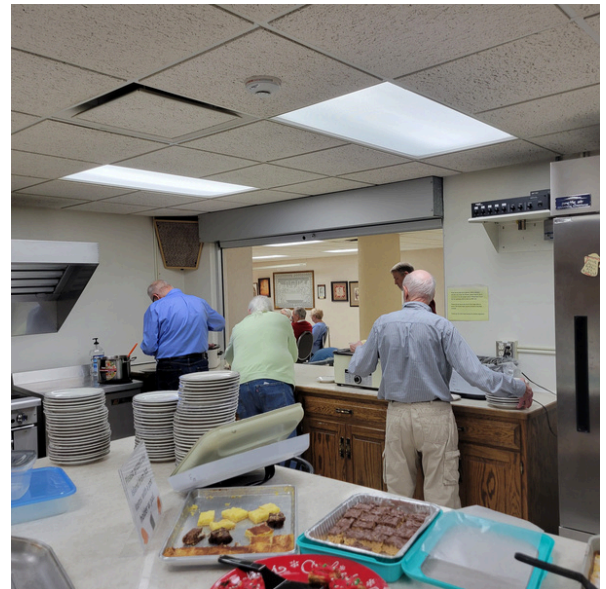
Men of Faith Potato Chili Feed, March 2025