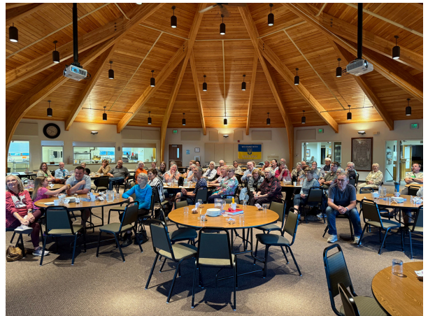
NC Mission Trip Sponsor Thank-you Dinner, September 2025