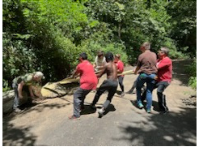
NC Mission Trip, July 2025