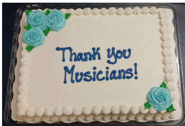
Musician Thank You Celebration, September 2025