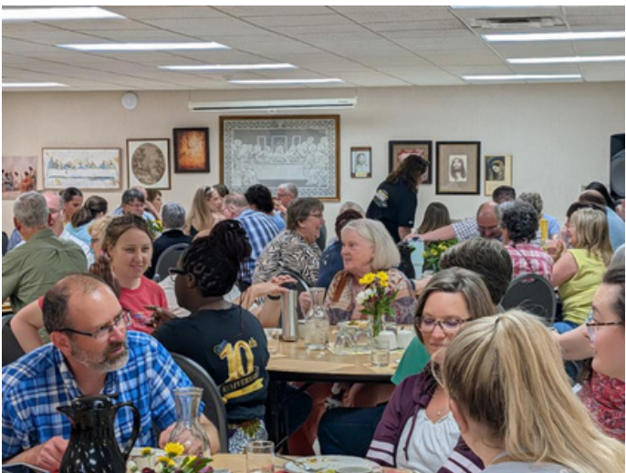
Taste of Home: Pakistan, July 2025