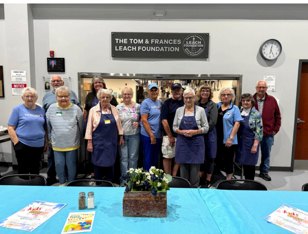
Serving the Banquet, September 2025