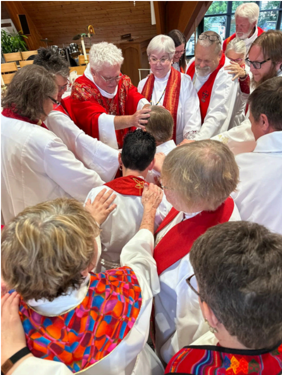
Summer Ordination, August 2025