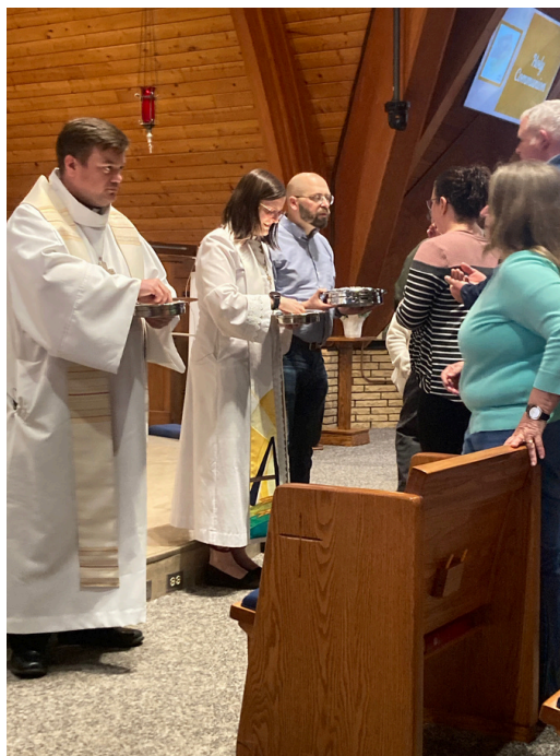
Communion During Service