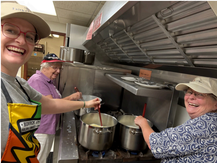
Rice Pudding, September 2025