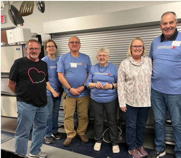
Serving the Banquet, March 2025