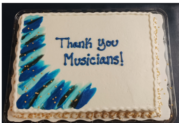
Musician Thank You Celebration, September 2025