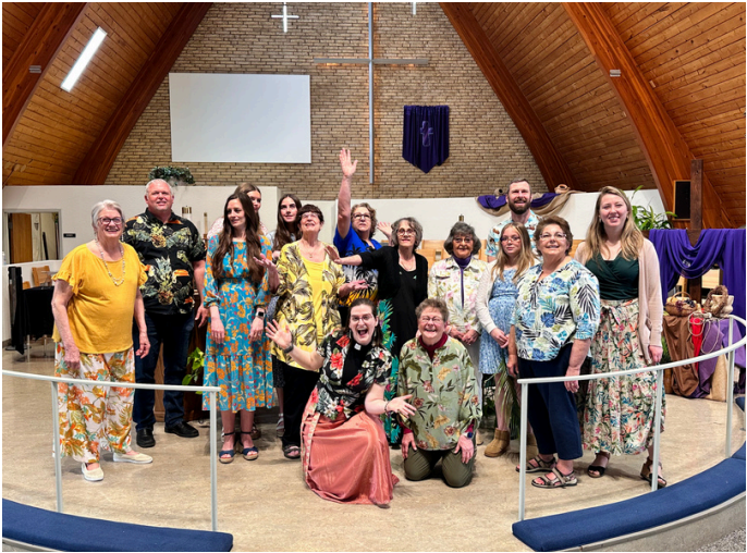
Palm Sunday 2025