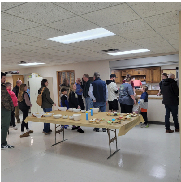
Men of Faith Christmas Supper, December 2025

We are looking forward to another year and want to extend an invitation to those who have yet to join this group. The membership fee is very minimal.....a few hours of your time and maybe a few dollars in a collection plate, how can one beat a deal like that, especially with the camaraderie and an occasional treat.