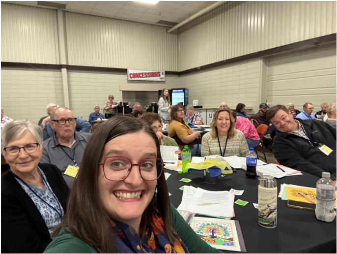
WND Synod Assembly, May 2025