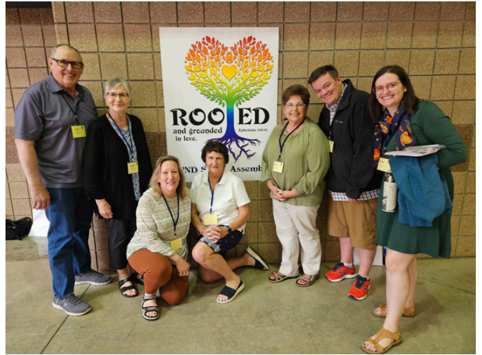
WND Synod Assembly, May 2025