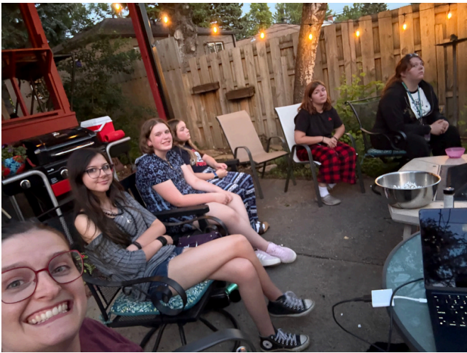
Youth Outdoor Movie Night